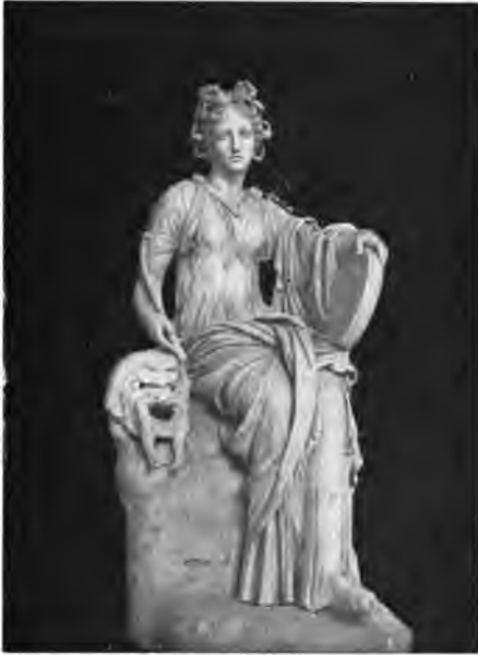
Fig. 37. Thalia.

the shears of the fates cut it off. Their names are given in the little verse from Lowell's Villa Franca : "Spin, spin, Clotho, spin! Lach'e sis, twist! and At'ro pus, sever!" They tell of the past, present, and future.